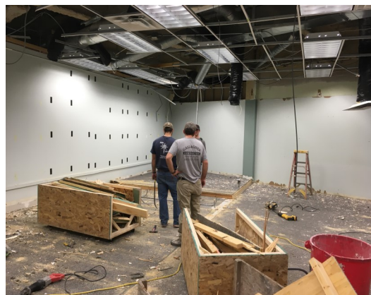
Owens Library #250 Refresh