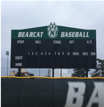
Baseball Scoreboard Branding