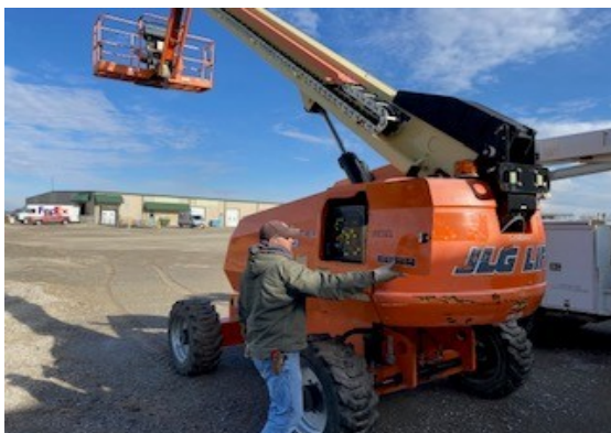
Maintenance & Custodial Boom Lift

Northwest FY20 budget approved the purchases of a few much needed new vehicles and equipment for Facility Services Operations Departments.