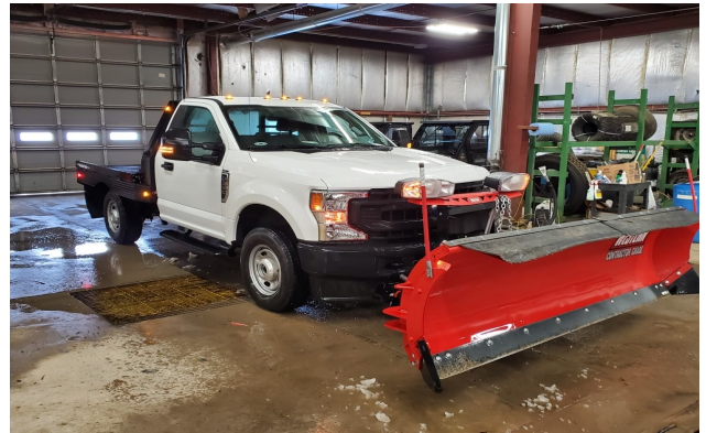
Landscape Water Truck