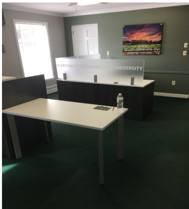
Mable Cook Refresh