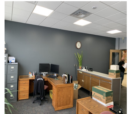
Fine Arts Front Office Refresh