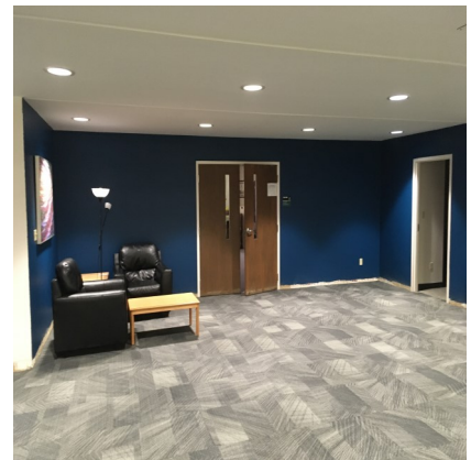
Owens Library Carpet & Paint